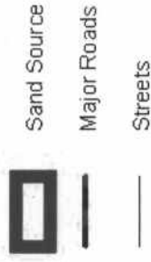
Exhibit A Sand Source Areas for Coachella Valley Preserve