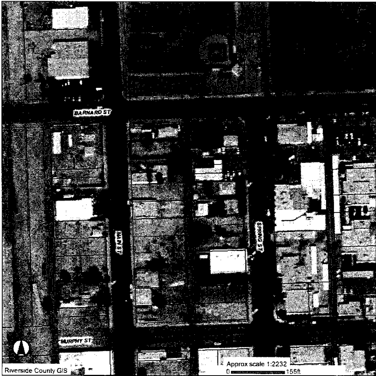
Exhibit A - 845-122-002