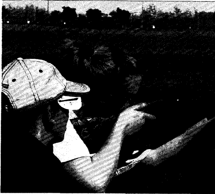
Certified Trained Instruction