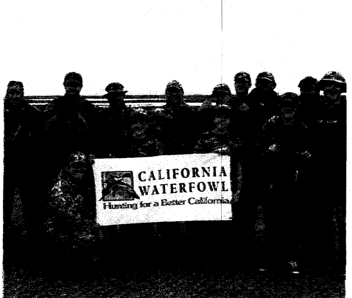
Exciting Outdoor Locations

Award-Winning Program! As seen on The Outdoor Channel