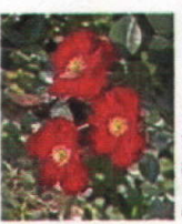
Rosa x 'Noire' - Red Carpet Roses