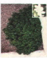
Carissa 'Bowwood Beauty' - Natal Plum