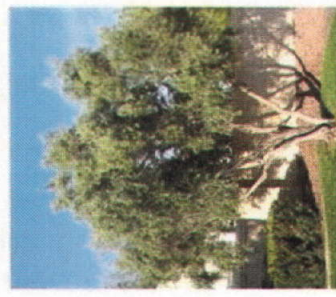
Olea europaea 'Swan Hill' - Fruitless Olive Tree