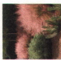
Muhlenbergia rigida - Purple Mully