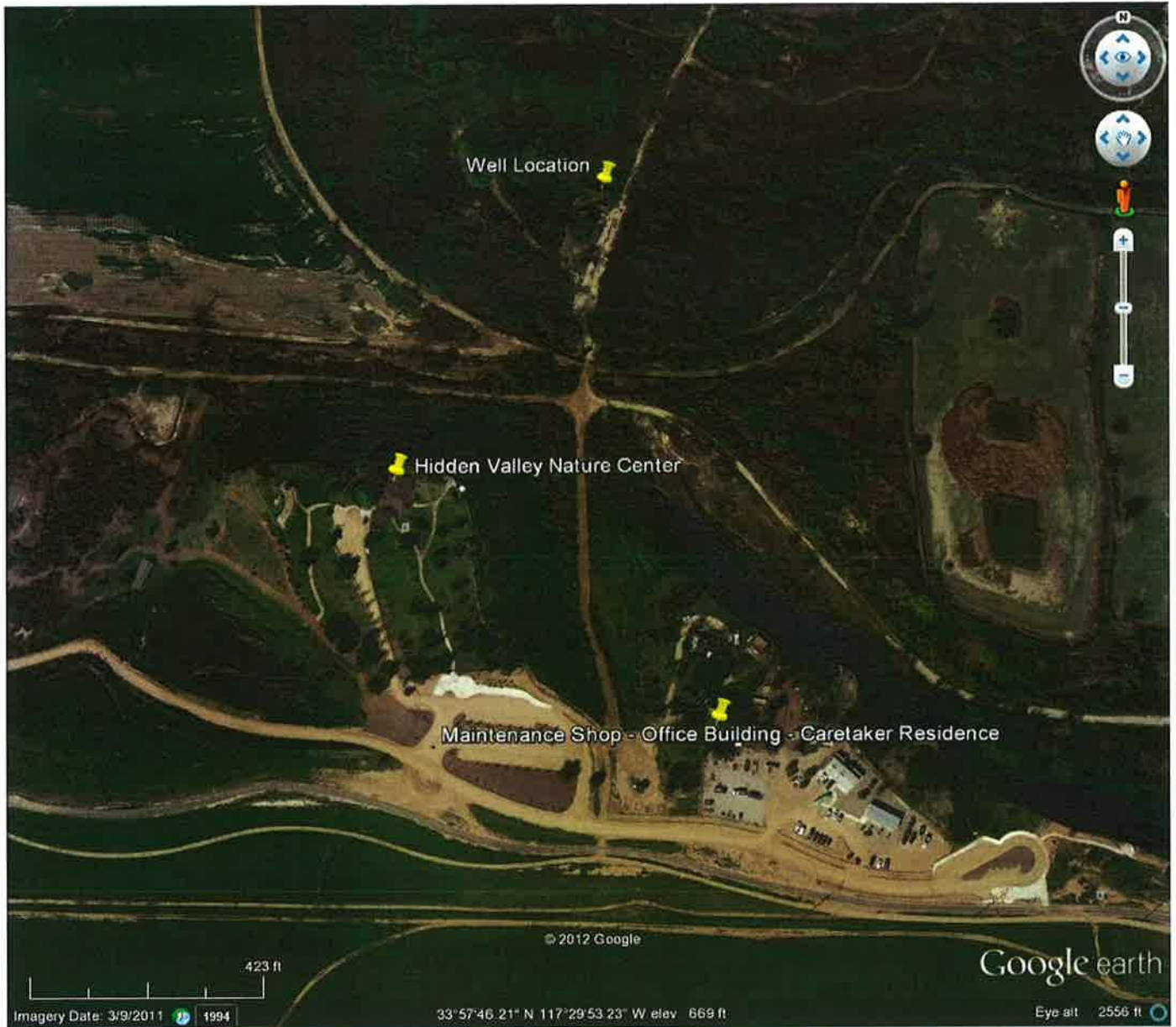
EXHIBIT 3 LOCATION MAP