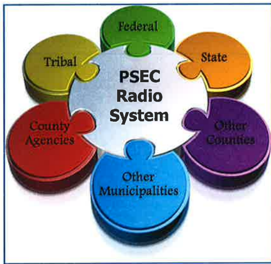
The PSEC Radio System provides interoperable communication, enabling County agencies to talk to other agencies when the need arises.

response personnel to maximize resources in planning for major predictable events such as the Super Bowl, a presidential inauguration, or for disaster relief and recovery efforts.