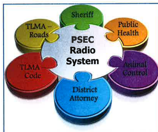
The PSEC Radio System provides interoperable communication, enabling County agencies to talk to each other when the need arises.

Public safety agencies in Riverside County currently use a variety of radio technologies, frequencies, and dispatching arrangements. Many of these are working successfully. At the same time, there are issues that must be resolved to improve interoperable communication. The lack of public safety interoperability is a long-standing, complex, and costly problem. One reason is the numerous variables present during situations requiring interoperable communication. Established protocols for event management must be put into place in order for interoperability to work. No two events are the same and therefore cannot be responded to in the same way. While several government programs have made great strides in addressing these issues, much of this work has been disconnected, fragmented, and often conflicted. The SAFECOM program was established in 2001 in an effort to coordinate the various Federal initiatives and eliminate the fragmentation and conflicts.