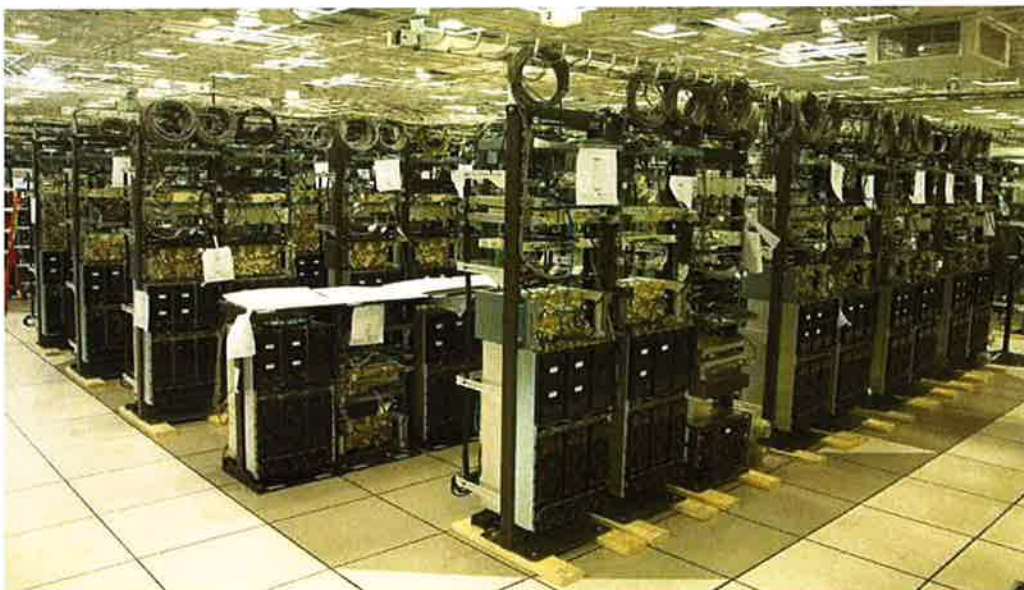
THE COMPLETE PSEC SYSTEM DURING STAGING IN SCHAUMBURG

The PSEC Governance Board is the environment in which this collaboration will take place. The main purpose of the PSEC Governance Board will be to provide oversight of the PSEC System and to improve communications and operations among participating public safety and service agencies. Upon implementation of the PSEC System, the Governance Board will be comprised of the existing PSEC Steering Committee members who will work with other agencies to set the standard for countywide collaboration and interoperable communication. Approval of the Governance Board by the Riverside County Board of Supervisors establishes an organizational and management structure for ongoing network administration, operation, and maintenance. The Board will provide a process for admitting other public safety and public service entities to join and participate in the PSEC System and will collaboratively define the allocation of costs associated with the network's operations, maintenance, and enhancement for members, both internal and external to Riverside County.