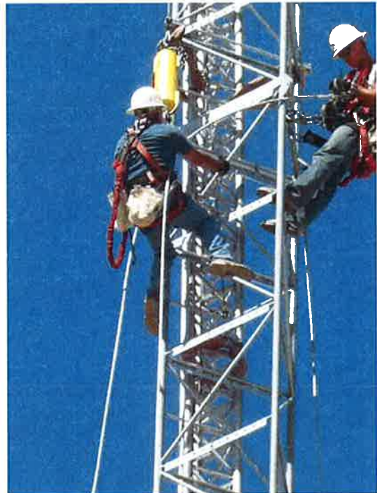
TOWER CLIMBERS INSTALLING EQUIPMENT

Upgrade to P25 Phase II – The P25 Phase II Standard was approved in November 2010. To transition to Phase II, requires a hardware & software upgrade. The upgrade will take the PSEC System from a proprietary system to an open standards-based system.