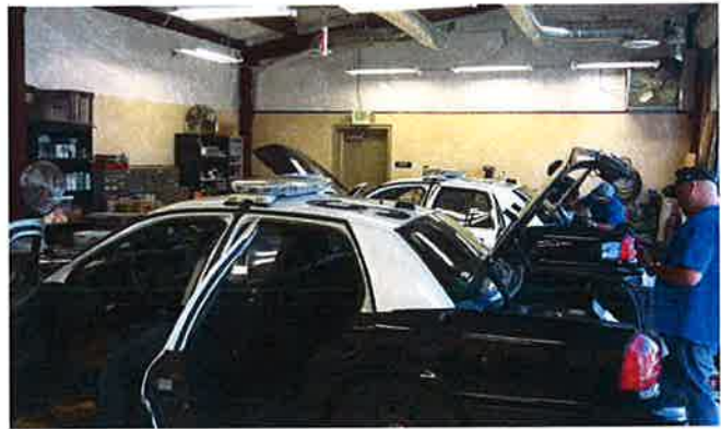
MEMBERS OF THE VEHICLE INSTALL TEAM

The mission of the Public Safety Enterprise Communication System is to provide and maintain an effective voice and data communication network for the Riverside County public safety and public service agencies, component units of the County, and other state and federal agencies.