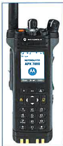
APX 7000 Dual Display Portable Radio

Calimesa Canyon Lake Coachella Eastvale Indian Wells Jurupa Valley Lake Elsinore La Quinta Menifee Moreno Valley Norco Palm Desert Perris Rancho Mirage San Jacinto Temecula Wildomar Morongo Indian Reservation