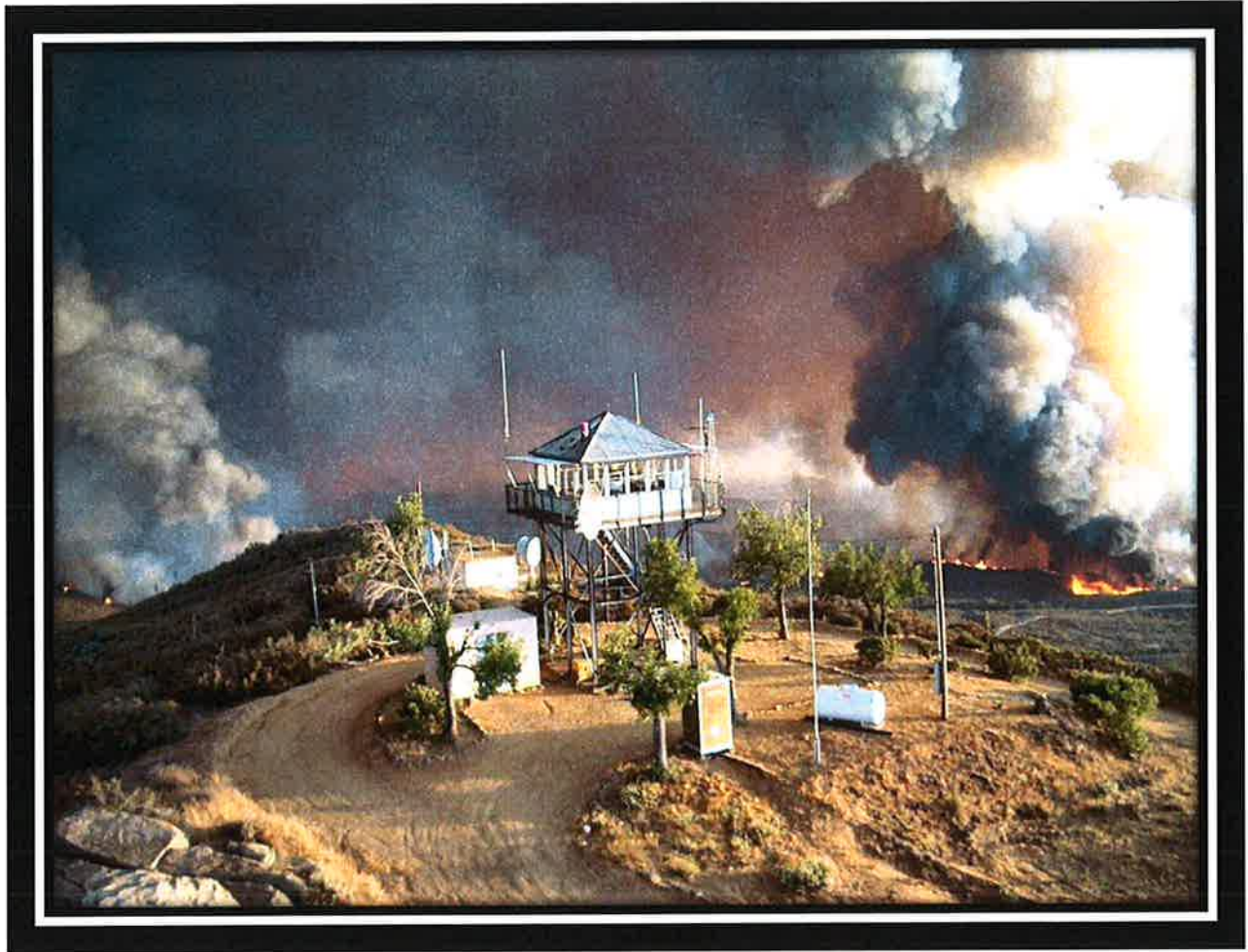
MOUNTAIN TOP COMMUNICATION SITE IN THE MIDST OF A FIRE