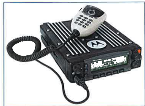
APX 7500 Mobile Radio