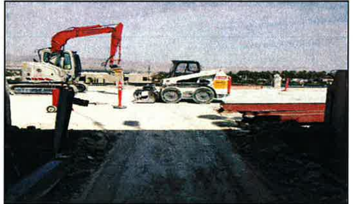
Figure 4. April 25, 2014: Law Library, Demolition Equipment on the Fourth Floor