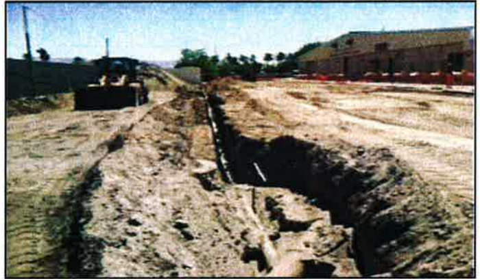
Figure 8. May 01, 2014: Asbestos Lined Pipe at Maintenance Parking, To Be Removed