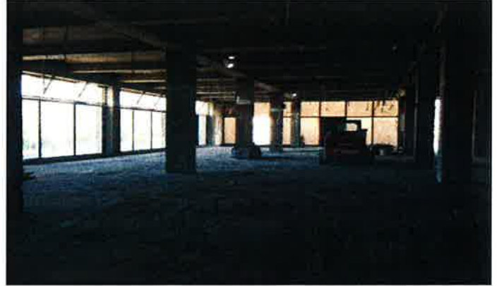
Figure 2. April 25, 2014: CAC Fourth Floor Interior Demolition