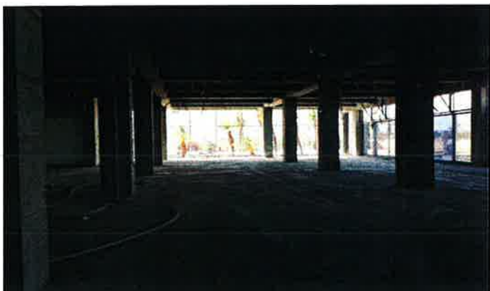
Figure 11. April 25, 2014: CAC Third Floor Interior Demolition