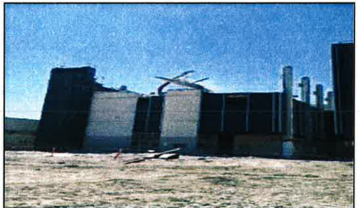
Figure 6. May 01, 2014: Law Library, Wall Demolition Part 2