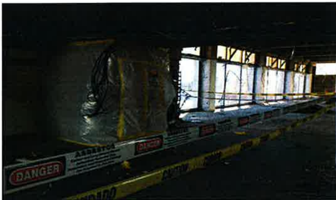
Figure 9. April 25, 2014: CAC Fourth Floor