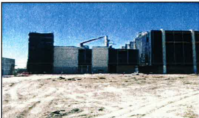
Figure 5. May 01, 2014: Law Library Demolition Part 1