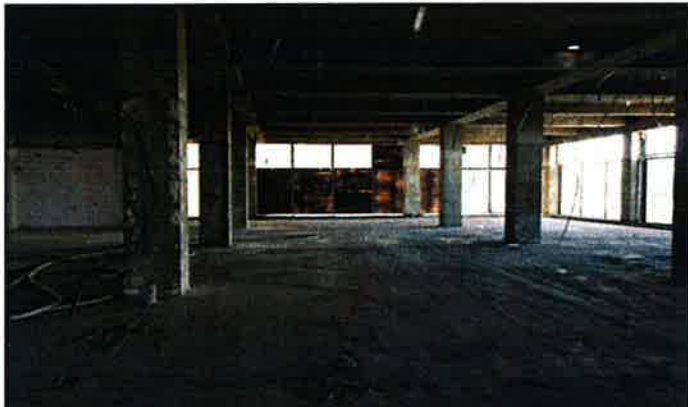
Figure 3. April 25, 2014: CAC Fourth Floor Interior Demolition