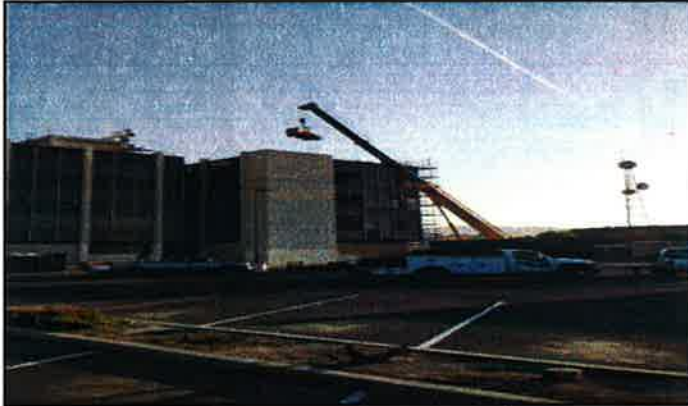
Figure 1. March 28, 2014: Crane Placing Demolition "Bobcat" on Law Library Roof