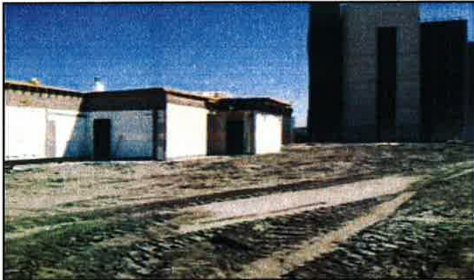
Figure 7. April 16, 2014: North Parking Lot and Superior Court Building Removed