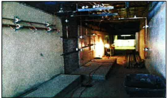
Figure 10. May 01, 2014: Existing Jail Corridor, Conversion to temporary Equipment Room