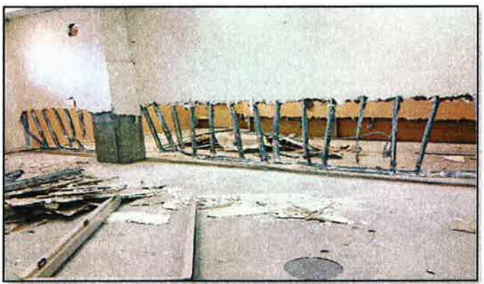
Figure 12. April 16, 2014: CAC First Floor Wall Demolition for Tile Abatement