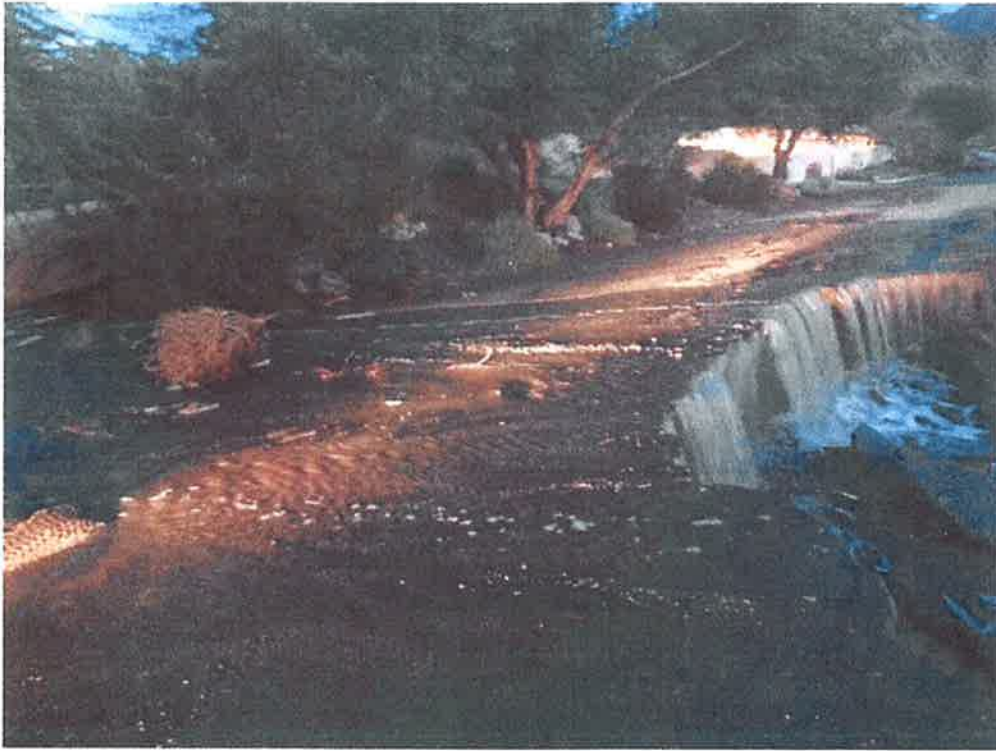
Collapsed portion of the road.