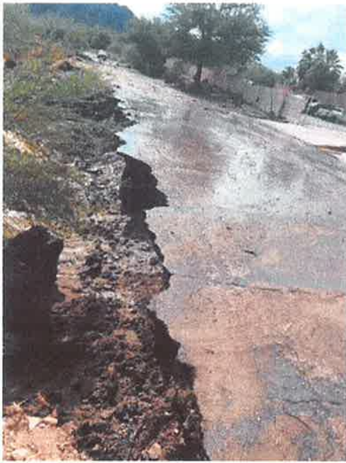
Erosion on banks of the road