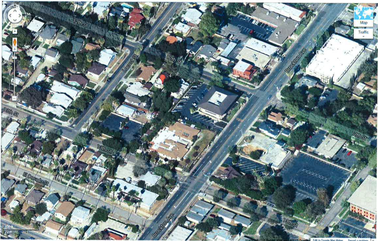
4168 12 th Street, Riverside, CA 92501 Assessor's Parcel Number 215-202-003