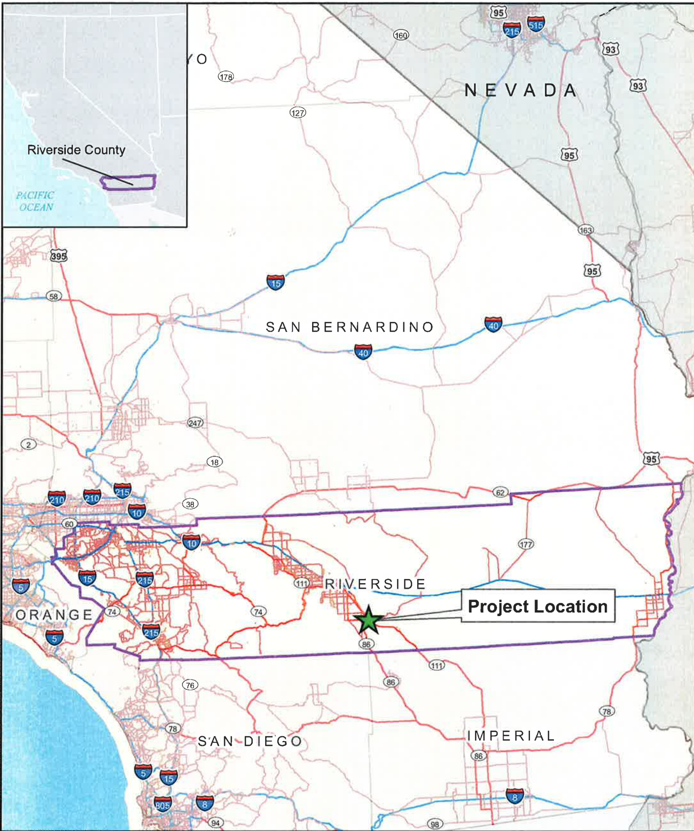
FIGURE 1 Project Vicinity Federal Project # PNRSCML 5956 (221) Avenue 66 Grade Separation Project Community of Mecca, Riverside County, California