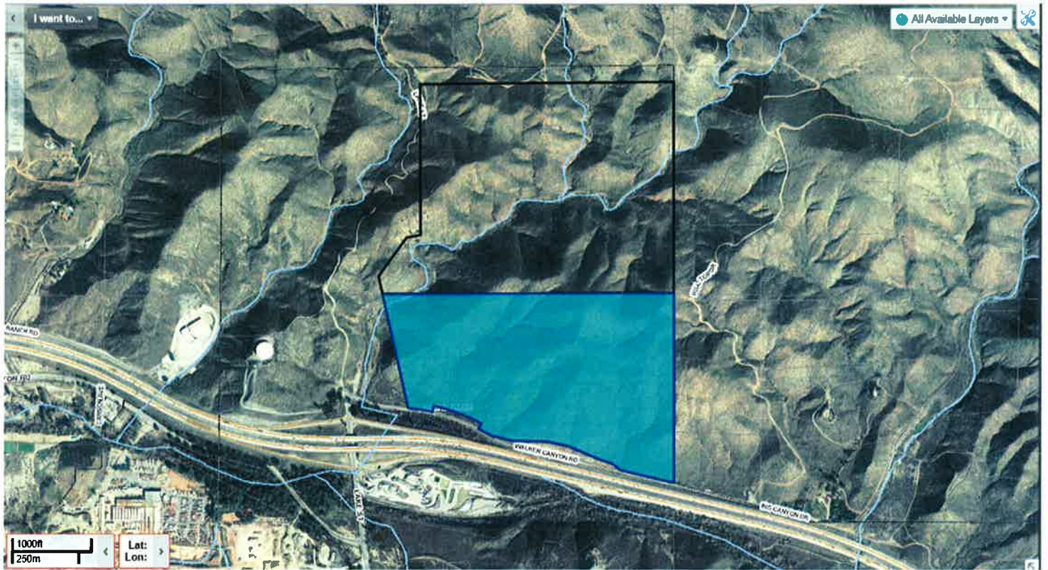
Second Amendment to the Transportation Enhancement Activities (TEA) Program Assessor Parcel Numbers: 390-110-006 and 390-120-016