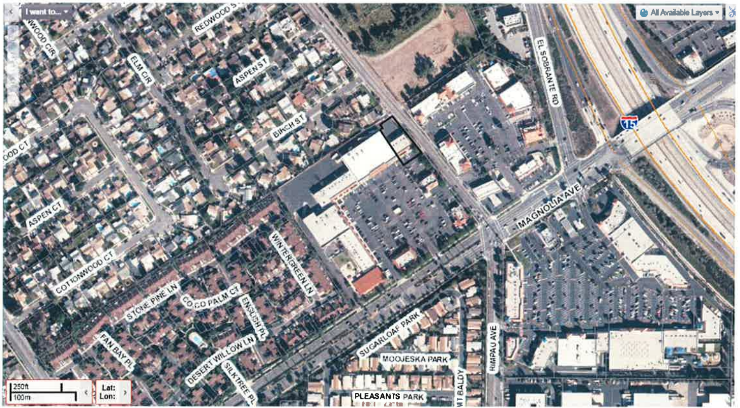
1195 Magnolia Avenue, Corona, California 91720 Assessor Parcel Number: 111-380-005