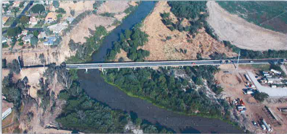
Existing Hamner Avenue Bridge at Santa Ana River (Looking West)

Hamner Avenue is an approximately 8.5-mile stretch of road extending through the Cities of Norco and Eastvale. The corridor runs parallel to Interstate 15 (I-15) and extends from Riverside Drive in the City of Eastvale (Eastvale) at the north end to the southern boundary of the City of Norco (Norco) at the south end. Hamner Avenue serves not only as a local arterial but also as an alternate route to the I-15. For more than seven decades, the Hamner Avenue Bridge, which is one of the few all-weather crossings over the Santa Ana River in the region, has been a critical link between Norco and the unincorporated areas to the north in Riverside County (subsequently the newly formed City of Eastvale).