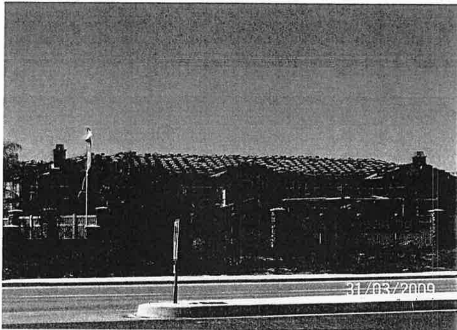
East Side of Property