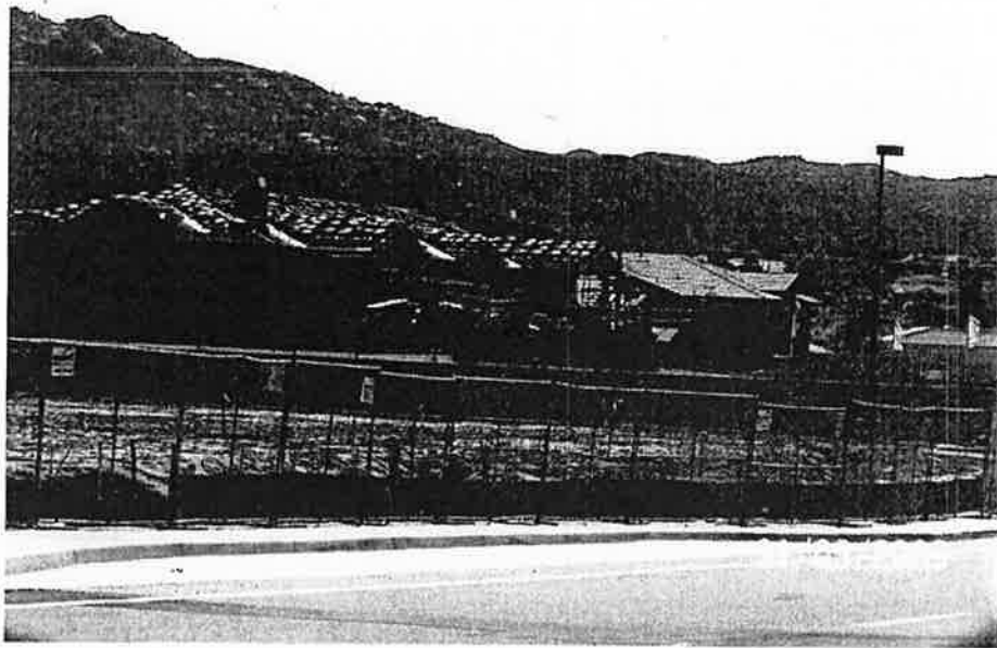
North Side of Property