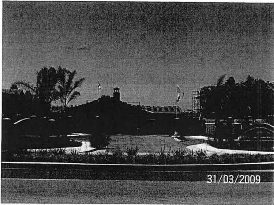
East Side of Property