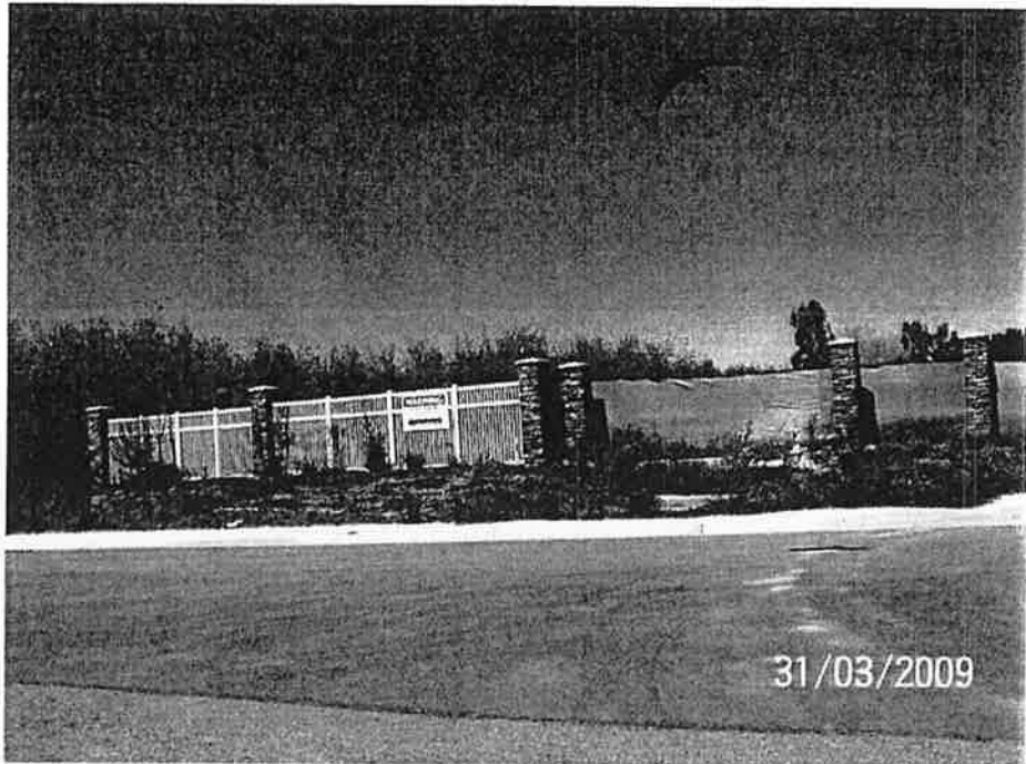
Southwest Side of Property