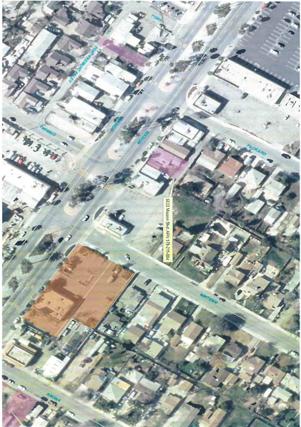
5533 Mission Blvd, Jurupa Valley