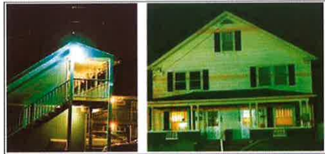
Figure 5. Example of light trespass from a floodlight installed by a hotel that casts light onto a house across the street