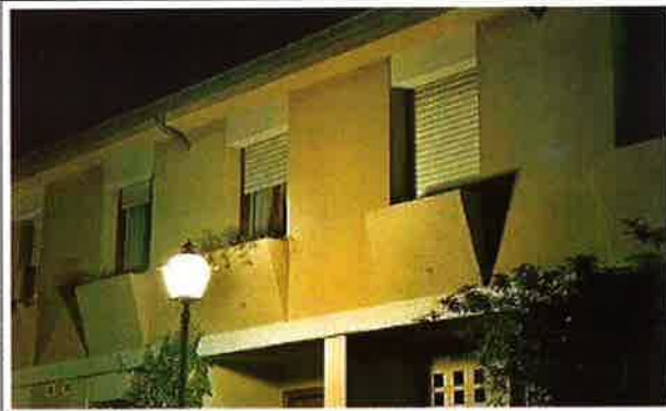
Figure 4. Example of light trespass