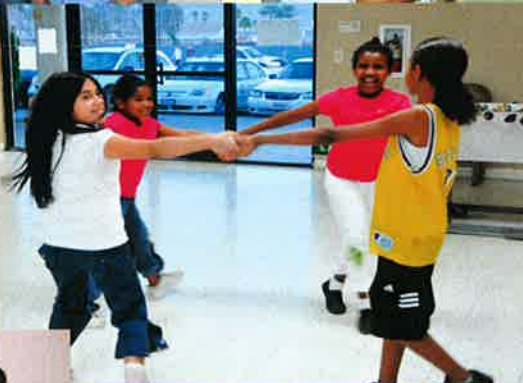
(Center picture) Burr Street and Labor Camp kids playing together