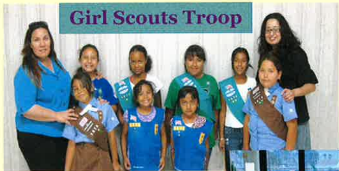
Girl Scouts Troop

Girl Scouts Troop needs a volunteer!!! Meets every Wednesday at 4:30pm at the Fred Young Labor Camp Kids Club.