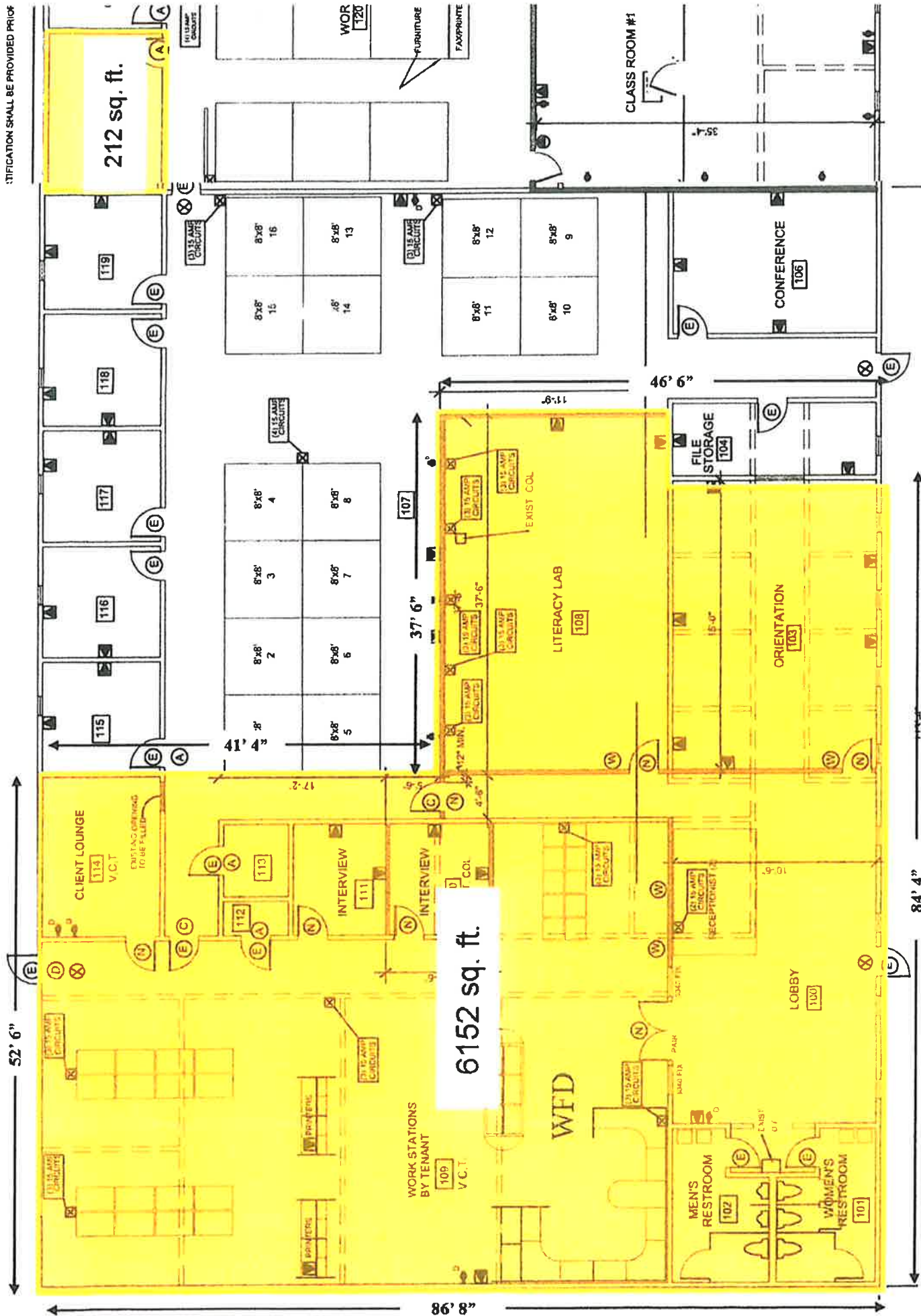
Exhibit F - 1025 State Street