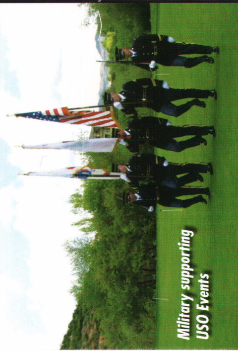
Military supporting USO Events