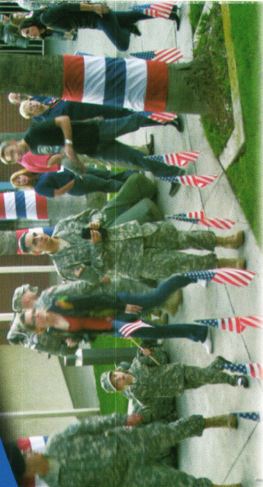
Welcome Home to Our Troops

In 1941 President Franklin D. Roosevelt challenged the American people to show their appreciation for military personnel. As a result of the challenge to do better, the United Service Organizations was created. For the past sixty-nine years the USO has provided entertainment, recreation and comfort centers for traveling servicemen and women. With substantial support from the Los Angeles World Airports, the USO Center at Ontario International Airport opened in October 2006. Prior to the opening of the Ontario USO, troops in the Inland Empire with flight layovers or transportation delays had nowhere to wait. Frequently, they had the discomfort of sleeping on benches and often had to settle with limited food and beverage access. The USO does not believe this is the proper way to treat those who defend our freedom and liberty of life.