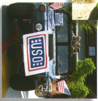
USO Fund Raisers

From the Ontario Airport Take Airport Shuttle to USO At Terminal 1