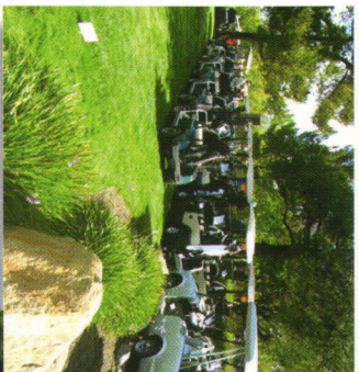
Dedicated Military Golf Tournaments

A Special Thanks to Each and Every Dedicated Volunteer Who Serve Selflessly 365 Days a Year.