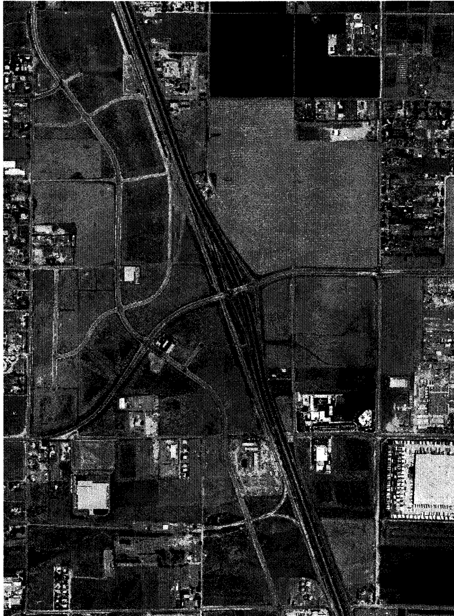
EXHIBIT A • LOCATION MAP

1 2 3 4 5 6 7 8 9 10 11 12 13 14 15 16 17 18 19 20 21 22 23 24 25 26 27 28 29