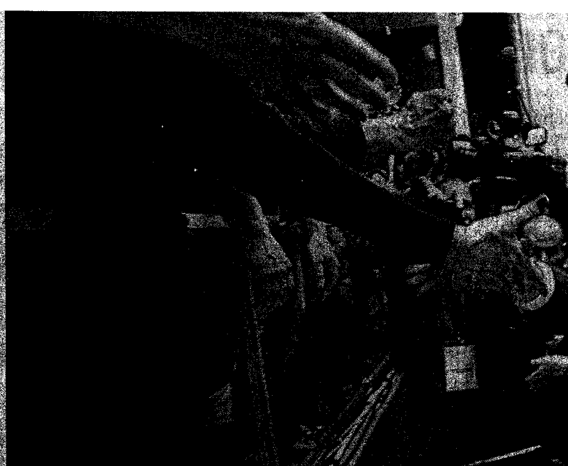
Socialist Party candidate Francois Hollande has worried financial markets when he vowed Sunday night to cut France's huge debts, boost growth and unite