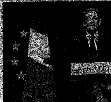
French President Nicolas Sarkozy said he remains concerned about jobs and immigration, and urged his compatriots to preserve their way of life.

With 98 percent of the vote counted, Hollande had