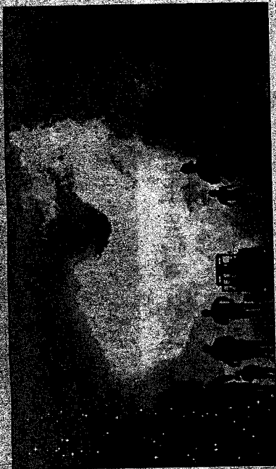
2010/AP The 2010 natural gas pipeline explosion in San Bruno left eight people dead and destroyed 38 homes.

"But to me, this illustrates they were not following federal regulations that are very clear, that if you don't have certain records, you have to assume you have them (seam weld failure) there and assess for it."