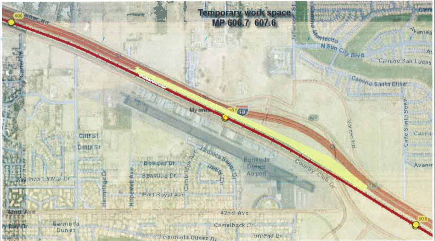
EXHIBIT "A" UNION PACIFIC RAILROAD COMPANY RAILROAD MILE POST 606.7 - 607.6 YUMA SUBDIVISION INDIO, CALIFORNIA