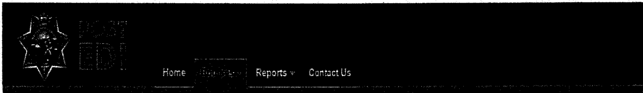
EXHIBIT A, ATTACHMENT I HOURLY DISTRIBUTION