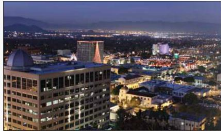
Small businesses in the region have an average annual salary of $1,400,960, making Riverside area the leader of 25 cities.