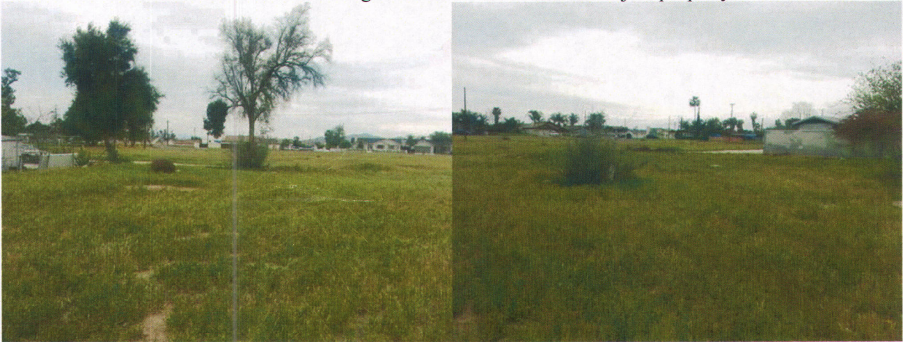
Photo below is the residential home located North of the subject property.

Photos below are facing South from the center of subject property.