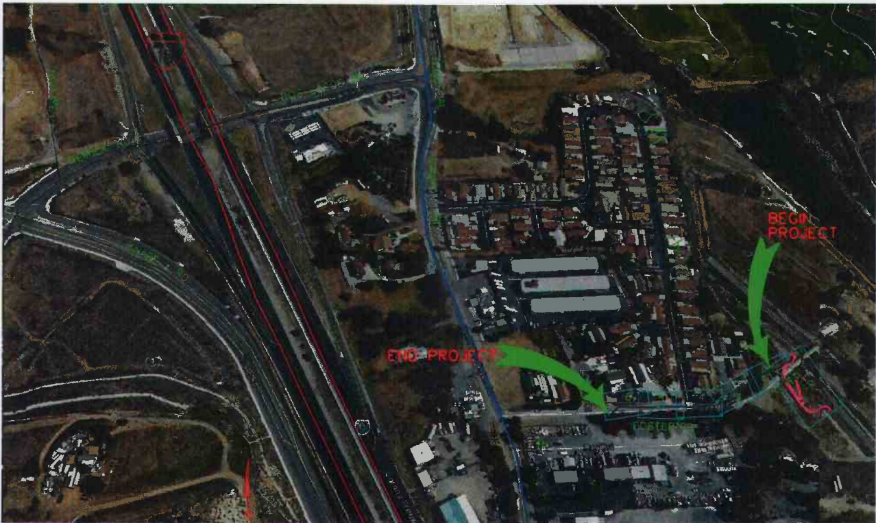
LOCATION MAP NTS

This project will consist of the construction of approximately 1700 lineal feet of reinforced concrete pipe (RCP) ranging from 60 inches to 72 inches for the mainline and 18 inches to 36 inches for the laterals. Three catch basins, one along Temescal Canyon Road and two along Foster Road, will collect local drainage. The outlet structure will be an impact type energy dissipator. The mainline will cross underneath Temescal Canyon Road and connect to an existing 54-inch culvert. The proposed project is located south of the City of Corona within unincorporated Riverside County, east of the I-15 freeway and south of Dos Lagos Drive.