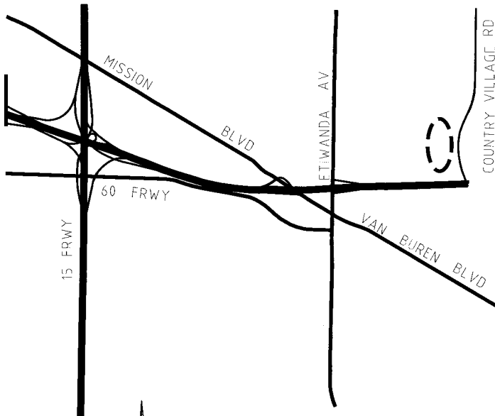
INDEX MAP NTS