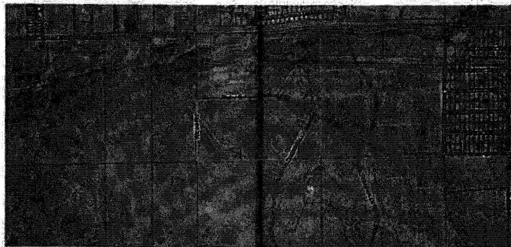
Figure 1: Project Location Map