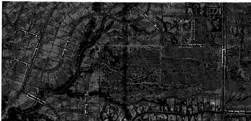
Figure 1: Project Location Map