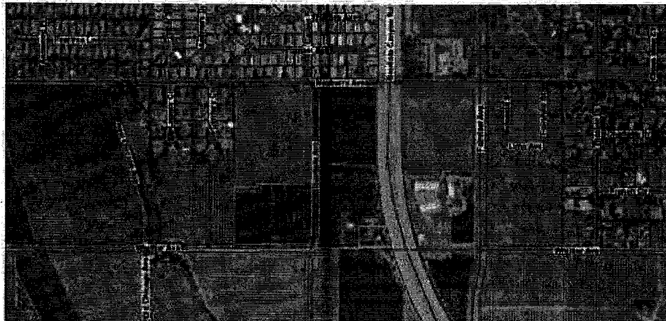
Figure 1: Project Location Map