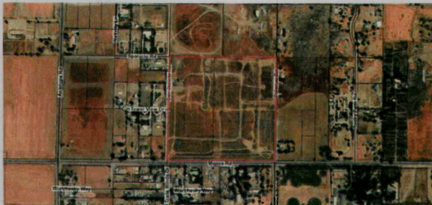
Figure 1: Project Location Map