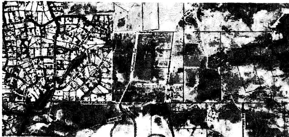
Figure 1: Project Location Map