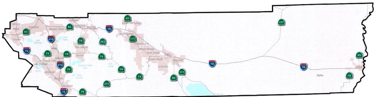
Map of the County of Riverside

On-call Assignments may be located anywhere within the jurisdictional boundaries of the County of Riverside as outlined in the map shown below.