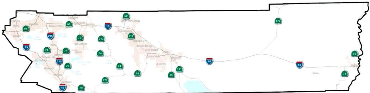
Map of the County of Riverside

On-call Assignments may be located anywhere within the jurisdictional boundaries of the County of Riverside as outlined in the map shown below.