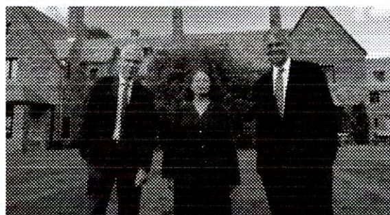
Dr. Martin Kulldorff, Dr. Sunetra Gupta, Dr. Jay Bhattacharya.

"As infectious disease epidemiologists and public health scientists, we have grave concerns about the damaging physical and mental health impacts of the prevailing COVID-19 policies, and recommend an approach we call Focused Protection," read the Great Barrington Declaration petition. "Current lockdown policies are producing devastating effects on short and long-term public health."