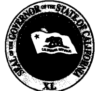
GAVIN NEWSOM GOVERNOR

State of California-Health and Human Services Agency DEPARTMENT OF COMMUNITY SERVICES AND DEVELOPMENT 2389 Gateway Oaks Drive, Suite 100, Sacramento, CA 95833 Telephone: (916) 576-7109 | Fax: (916) 263-1406 www.csd.ca.gov