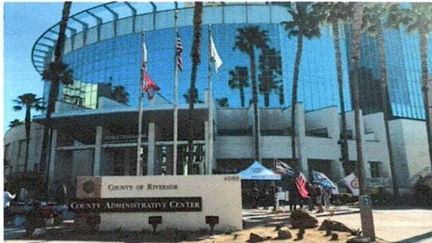
Members and supporters of New California State gathered outside of the Riverside County Administration Center ahead of the April 9 Board of Supervisors meeting.