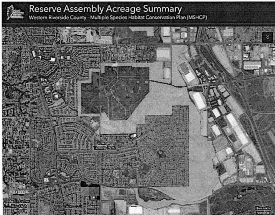
Screenshot of MSHCP designation of public/quasi-public lands for March West Campus on Western Riverside County MSHCP Acreage Summary. 3

There are fewer than 30 days until the land-use transfer, so we understand procedurally that there isn't time to do proper community engagement. We ask that the County commit to revisions of the March Area Plan that (1) incorporate community feedback, (2) reflect current conditions and agreements, and (3) appropriately identify public/quasi-public lands already included in the MSHCP as Foundation Component: Open Space rather than Community Development. However, we request that the Planning Commission and County commit to revising the Specific Area Plan for the March Area to reflect community feedback no later than December 31, 2025 . An additional six months is sufficient time to update the documentation and engage in authentic community visioning.