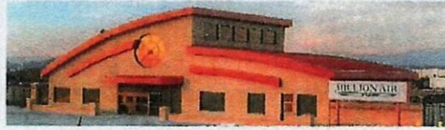
MIPPA's terminal at the March Air Reserve Base

The March Inland Port Airport Authority (MIPAA) was formed by the JPA in 1996 for the purpose of creating a public use airport on the March Air Reserve Base. MIPAA shares aviation facilities with the March Air Reserve Base including a staffed control tower, taxiways, nav aids, runways, and maintenance facilities. The runway is 13,300 feet long.