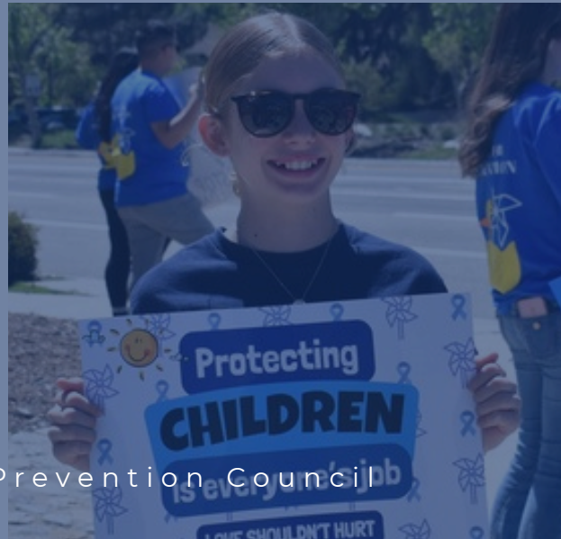
Riverside County Child Abuse Prevention Council