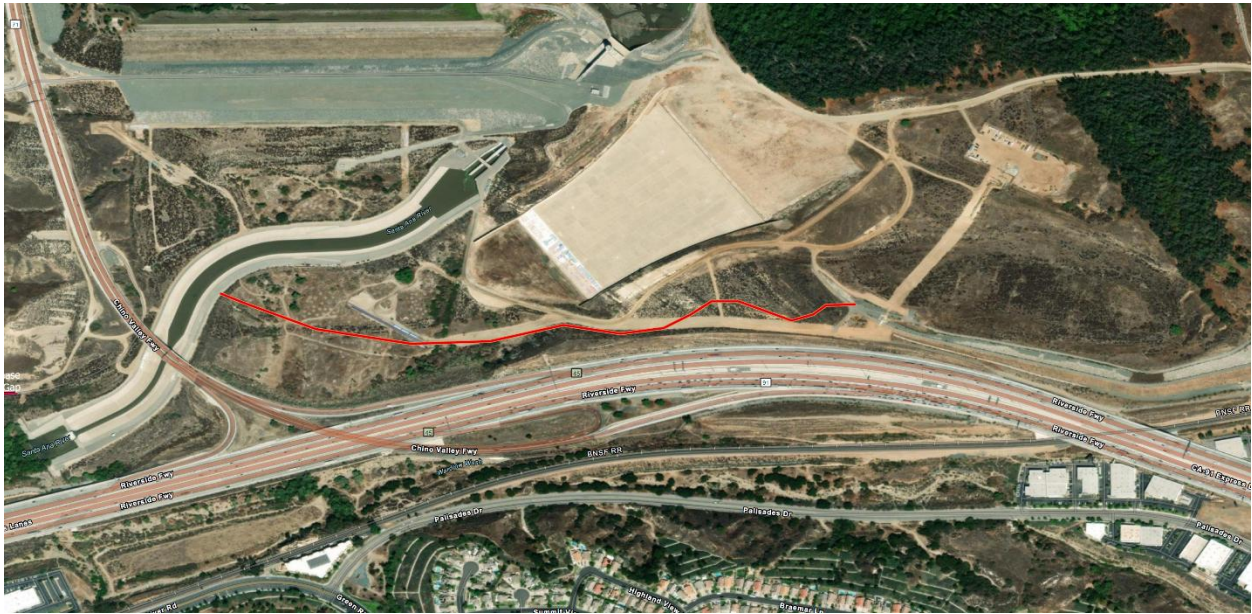
EXHIBIT "A" PROJECT MAP